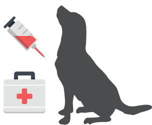
Mass vaccination of dogs will help eliminate the fatal virus

The brutal and unhygienic slaughter and butchery of dogs and consumption of meat from rabies-positive animals puts humans at risk. Human deaths from rabies have been reported that have been directly linked to involvement in the slaughtering, butchery, handling and even consumption of meat from infected dogs.