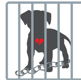
Immense Animal Suffering