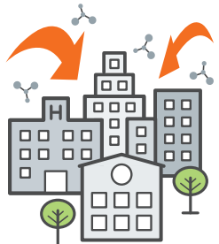
Rabies positive dogs are being moved to supply highly-populated cities that are often dog meat eating hot spots